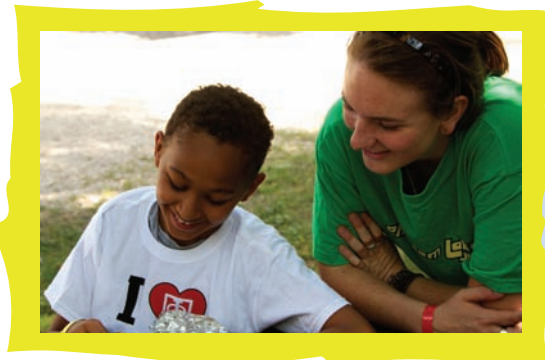
Camper and Staff working on crafts outside.

Tell a friend and get a 20% rebate at the end of summer.